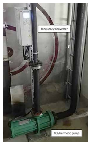
Multistage HERMETIC series CAMh canned motor pump that is used in the pilot plant and which is equipped with a speed-regulated drive.