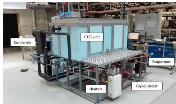
Experimental pilot plant with pump circulation CO 2 as refrigerant.