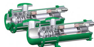
CAM / CAM(R)